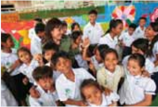
Phymean dancing with kids at SMC