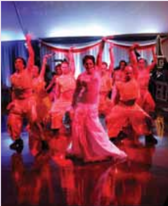
Dancers perform at A Night In Paris