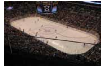
Panthers vs. Rangers Game

Outside the Bank Atlantic Center in Fort Lauderdale, Florida, Perfect Party Ponies provided pony rides to kids during pre-game festivities, showing off JustWorld saddle pads!