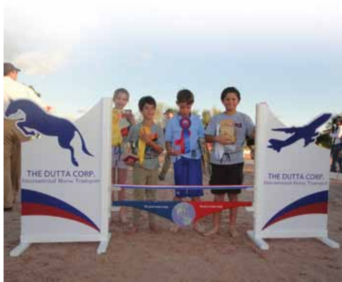
Competitors at the jump of Horseless Horse Show Presenting Sponsor Dutta Corp