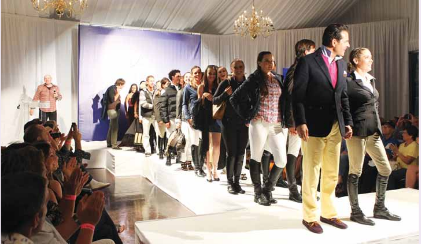
Final runway with all models