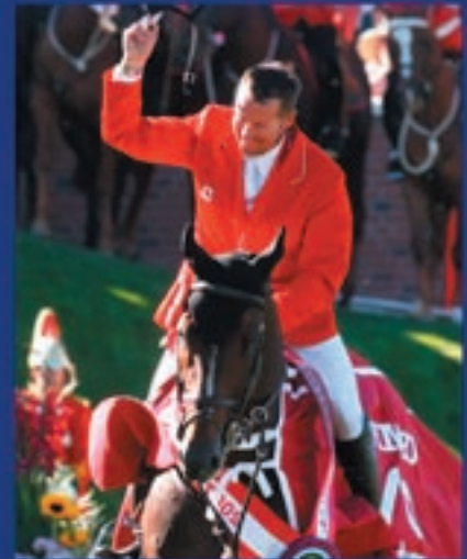
Jos Lansink , 2006 World Champion in Aachen