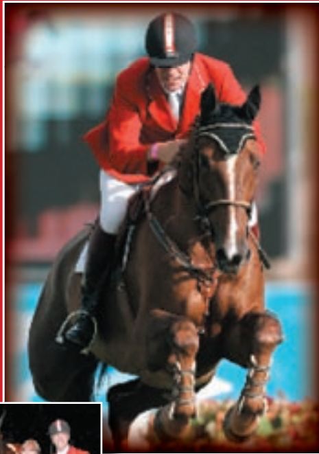
Ian Millar and Promise Me 24th Individually 2004 Olympic Games, Athens, Greece