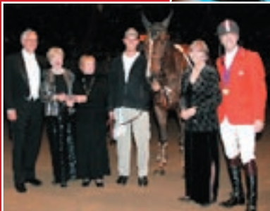
Ian Millar accepts the 2004 Jump Canada Owner of the Year Award on behalf of the Bakers Dozen, owners of Promise Me